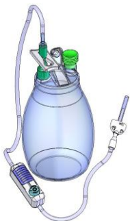
Example of a chest drainage bottle

If you or your carer are not able to drain the fluid, then we will arrange for a district nurse to do this for you. We will make the arrangements.