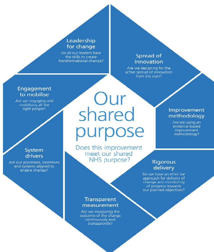
Figure 2: NHS Change Model

The NHS Change Model brings together collective improvement knowledge and experience from across the NHS. It has been developed with hundreds of our senior leaders, clinicians, commissioners, providers and improvement activists who want to get involved in building the energy for change across the NHS by adopting a systematic and sustainable approach to improving quality of care. Through applying all eight components change can happen”