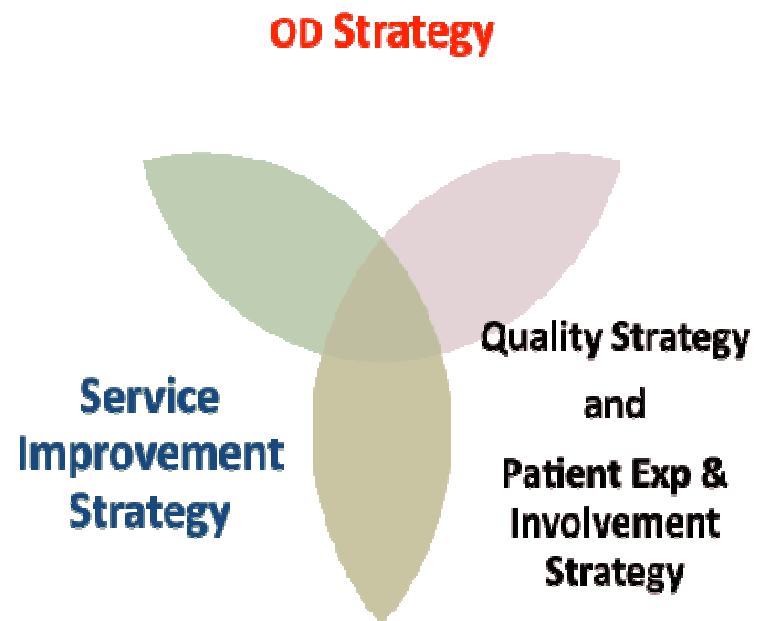
Figure 1 – Alignment of service improvement, OD and quality strategies