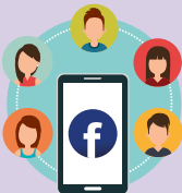
#SFH Facebook Group