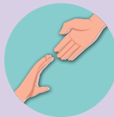
Safeguarding and Domestic Abuse