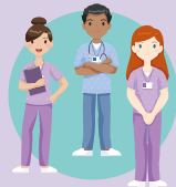
Our NHS People