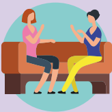
Health and Wellbeing Conversations