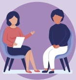
Speak Up Guardian