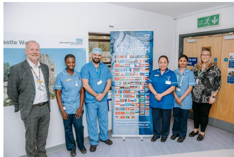
On the 1 st of March 2024 Sherwood Forest hospitals celebrated Overseas NHS Workers Day.