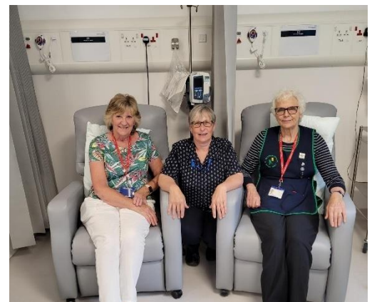
New recliner chairs are presented to the Medical Day Case Ward at Newark Hospital

Notable events from the Trust's Community Involvement team, our Sherwood Forest Hospitals Charity and our team of Trust volunteers over the past month have included: